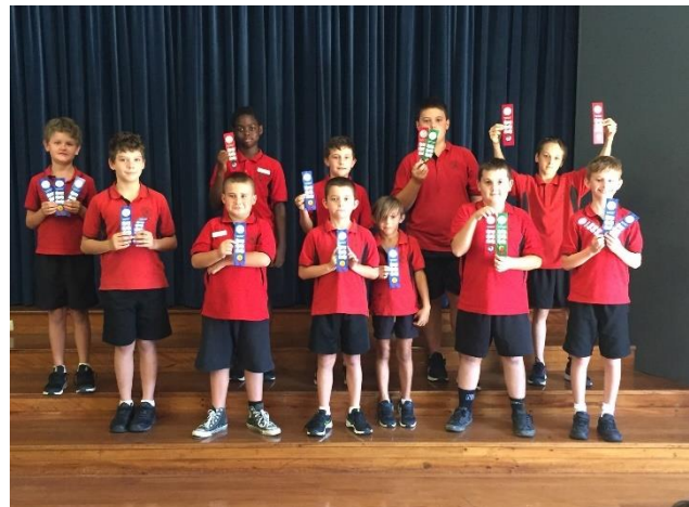
Boys Swimming Event Winners