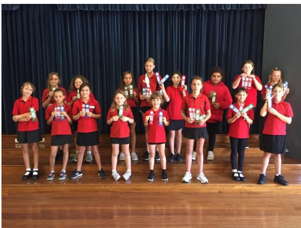
Girls Swimming Event Winners